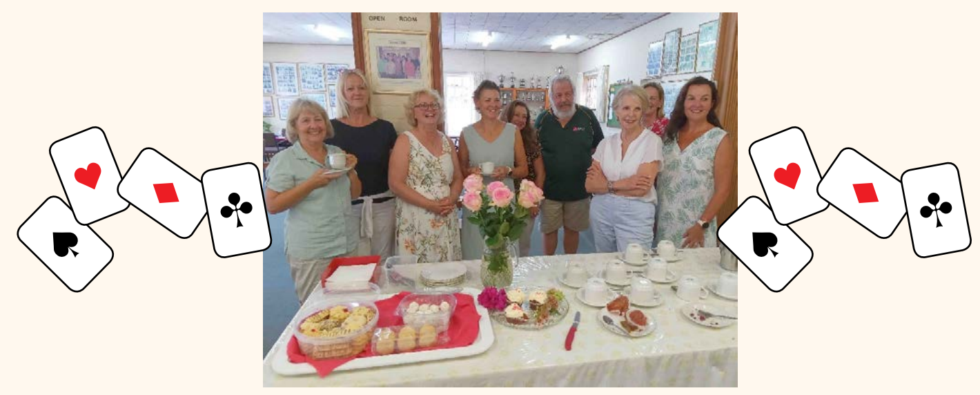
Valentine's Day - learners and practice group