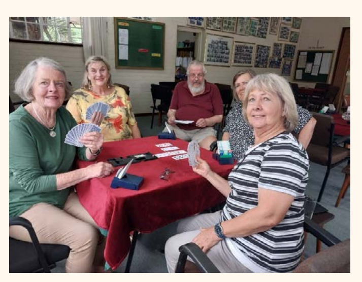
Friday morning learners-lots of fun and laughter