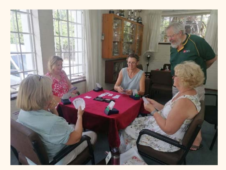
Tuesday afternoon learners.

Included below are pictures taken from lesson sessions.