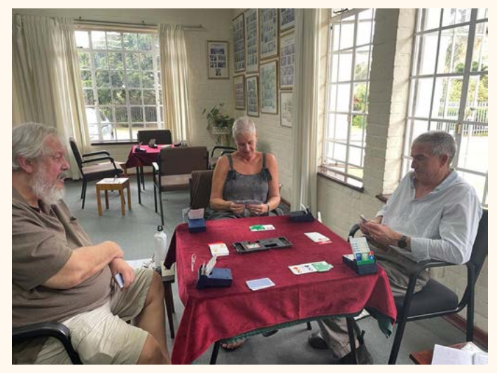
Tuesday afternoon learners.